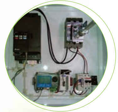
AG LIFT STATION INSTALLATION DETAIL

Installation shall be in accordance with ADS published installation guidelines, with maximum vertical height of 12-feet (3.66 m) with compacted class 1, class 2, class 3 or class 4 material. Contact your local ADS representative or visit our website at www.ads-pipe.com for a copy of the installation guidelines.